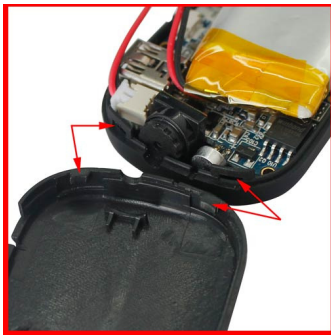
(1) Note the two latches inside the case.

Note: Please don't do this unless you have to change the battery or lens/sensor module.